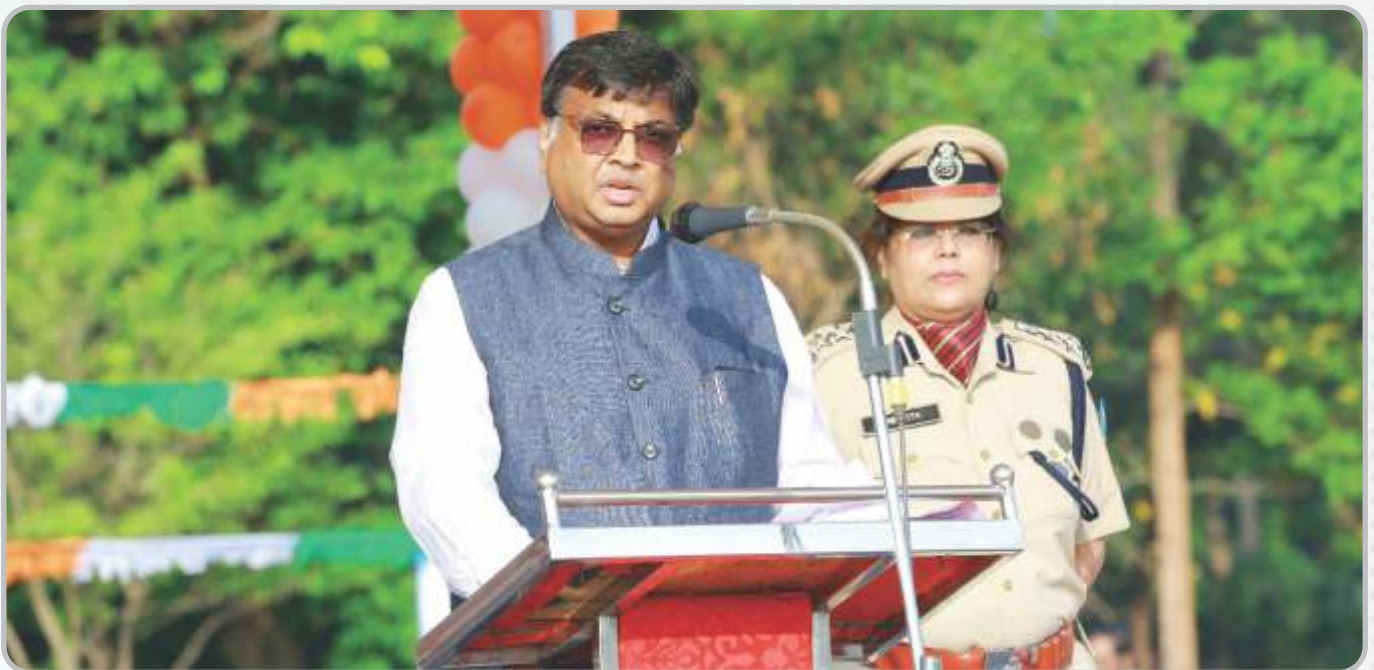
Shri Kishor Rungta, CMD, delivering the Republic Day Message