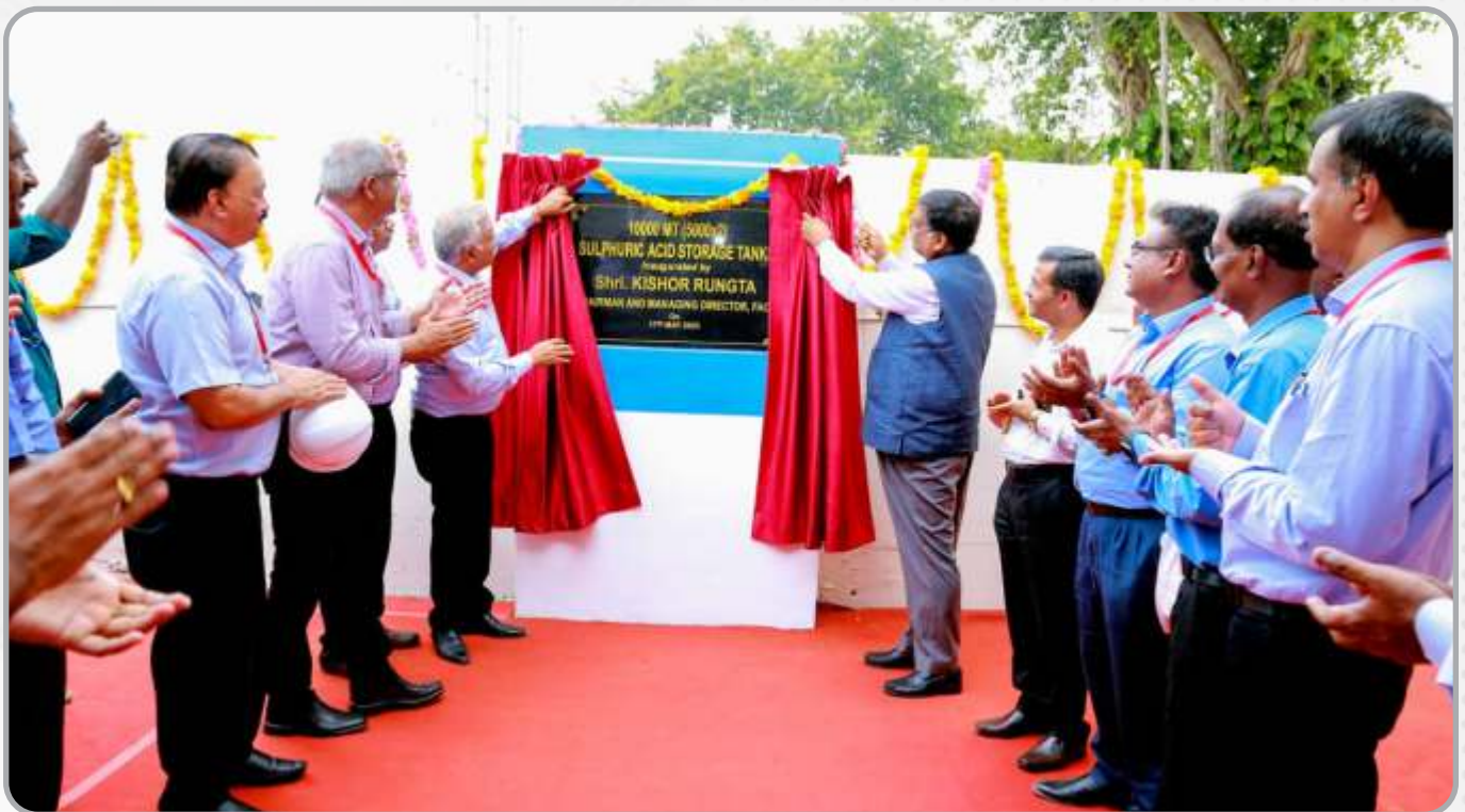
Shri Kishor Rungta, CMD, inaugurating new Sulphuric Acid Plant in FACT Cochin Division