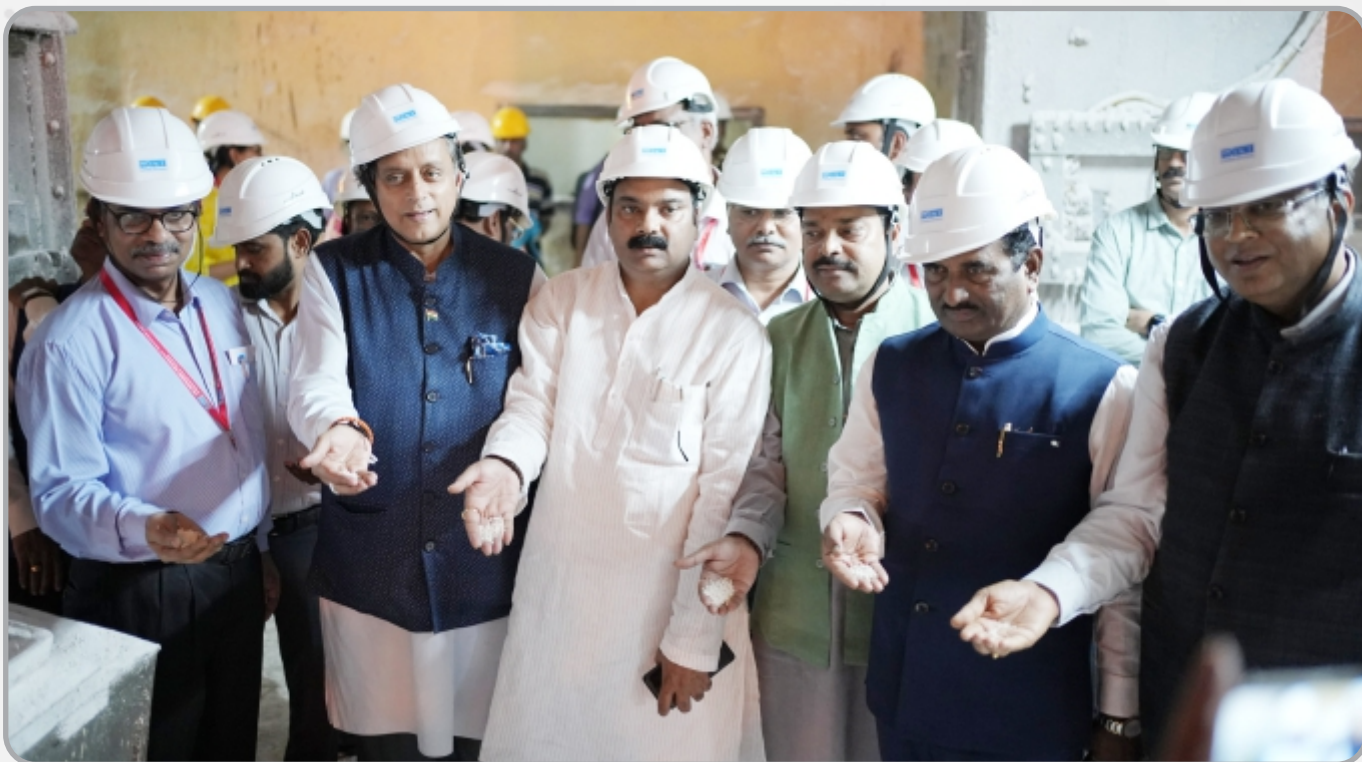
The Parliament Standing Committee on Chemicals and Fertilizers visiting FACT Fertilizer plants and railway sidings at FACT Cochin Division