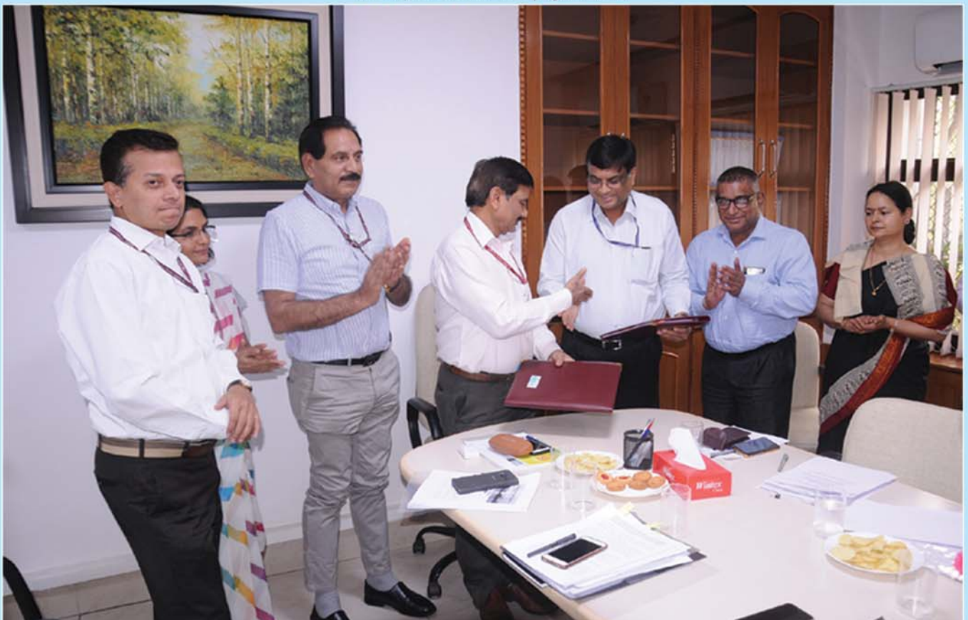
FACT and Department of Fertilisers hands over signed MOU at New Delhi